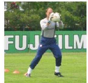
Kasey Keller giving 100% on routine drills

Be there and be focused. If you let your energy and attention drift you are now just wasting your own time. Sometimes you can draw your energy from the practices/events . There are times when these can be not the most exciting or they are repetitive and low key, or maybe you've had a bad day. Know yourself and find ways to